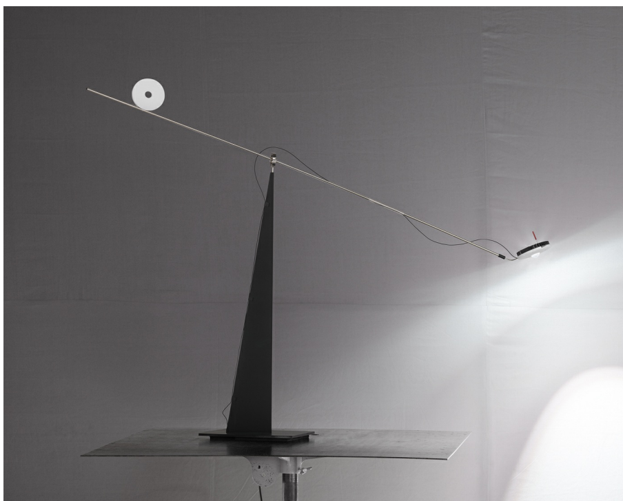
Keep Balance INGO MAURER 2016

Keep Balance is the LED version and a design variation of Ru Ku Ku. Keep Balance poises an LED with a black and white body on and a flat white disk at the two ends of a metal rod. The table lamp has a height of 60 cm and is rotatable through 360°. A joint in the shape of a ring allows adjusting the angle of the horizontal rod.