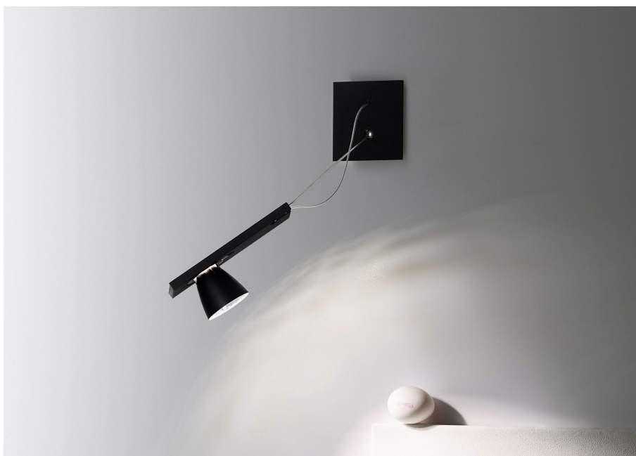
WaLL.E.D KONRAD LOHÖFENER, HAGEN SCZECH 2017

The wall lamp is usually available for immediate delivery. Aluminium, stainless steel, plastic. One ball-joint provides flexibility. Removable reflector for use as spot. WaLL.E.D is a minimalistic and linear wall and ceiling luminaire for directional or general lighting. The main body of the fixture is an aluminium profile which serves also a cooling function for the LED module. By clipping on the additional cylindrical reflector, WaLL.E.D can be used as a directional spot. A ball-joint and the angled rod allow for flexible adjustments. The line-voltage LED module can be hardwired without the need for a transformer. Appropriate for both surface or flush mounting.