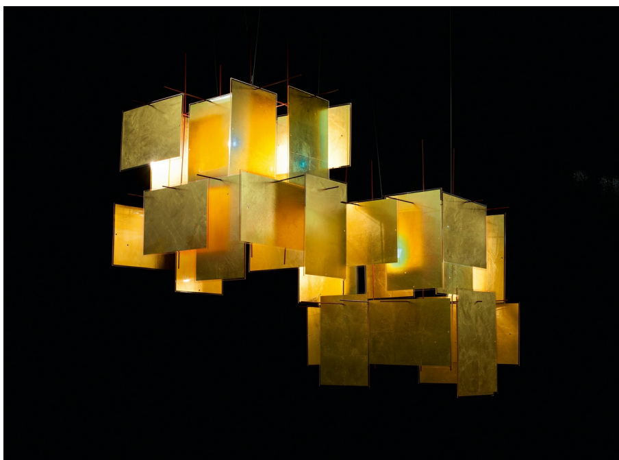
1000 Karat Blau AXEL SCHMID 2009/2016

1000 Karat Blau is a large, impressive pendant luminaire with the effect of a light object. The gold leaf in the acrylic shades reflects the warm, long-wave portion of the light back and forth, creating a particularly cozy atmosphere. As with the smaller 24 Karat Blue, which has been part of the Ingo Maurer collection since 2005, only the short-wave blue light can shine through between the molecules of the gold leaf. This makes the point of light appear bluish. Large clusters can be created by connecting several pieces together.